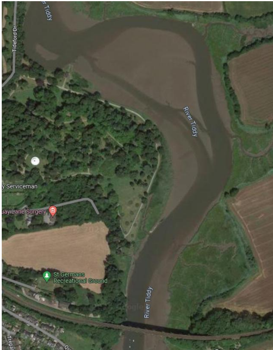
The Channel north of the Viaduct